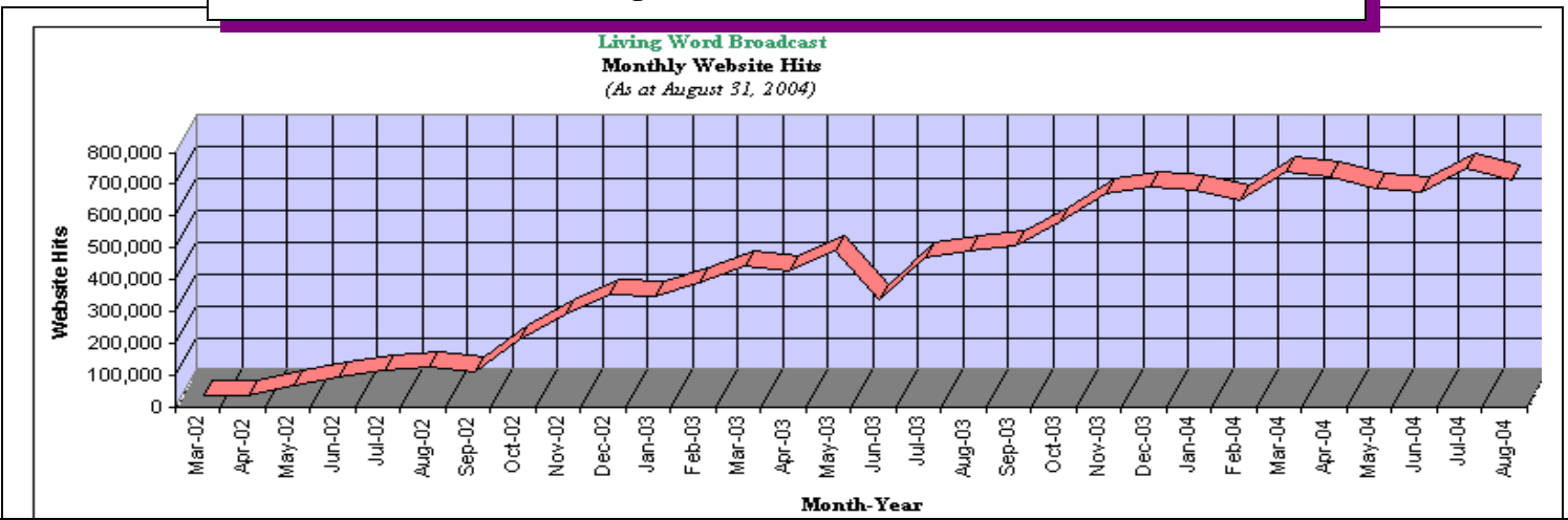
Living Word Broadcast – Website, Tune-in, Sermon Download & Book Distribution - Summary Statistics Generated on 31 August-2004 11:59 PM Central Standard Time

Living Word Broadcast - Website Usage Statistics - Summary by Month Generated on 31 August-2004 11:59 PM Central Standard Time